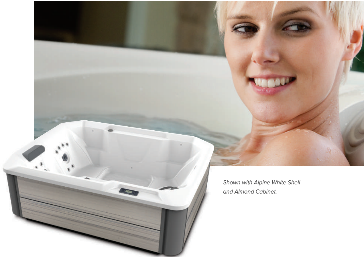
Shown with Alpine White Shell and Almond Cabinet.

People Seating Jets Voltage 3 Seats Lounge 20 Jets 115 V or 230 V