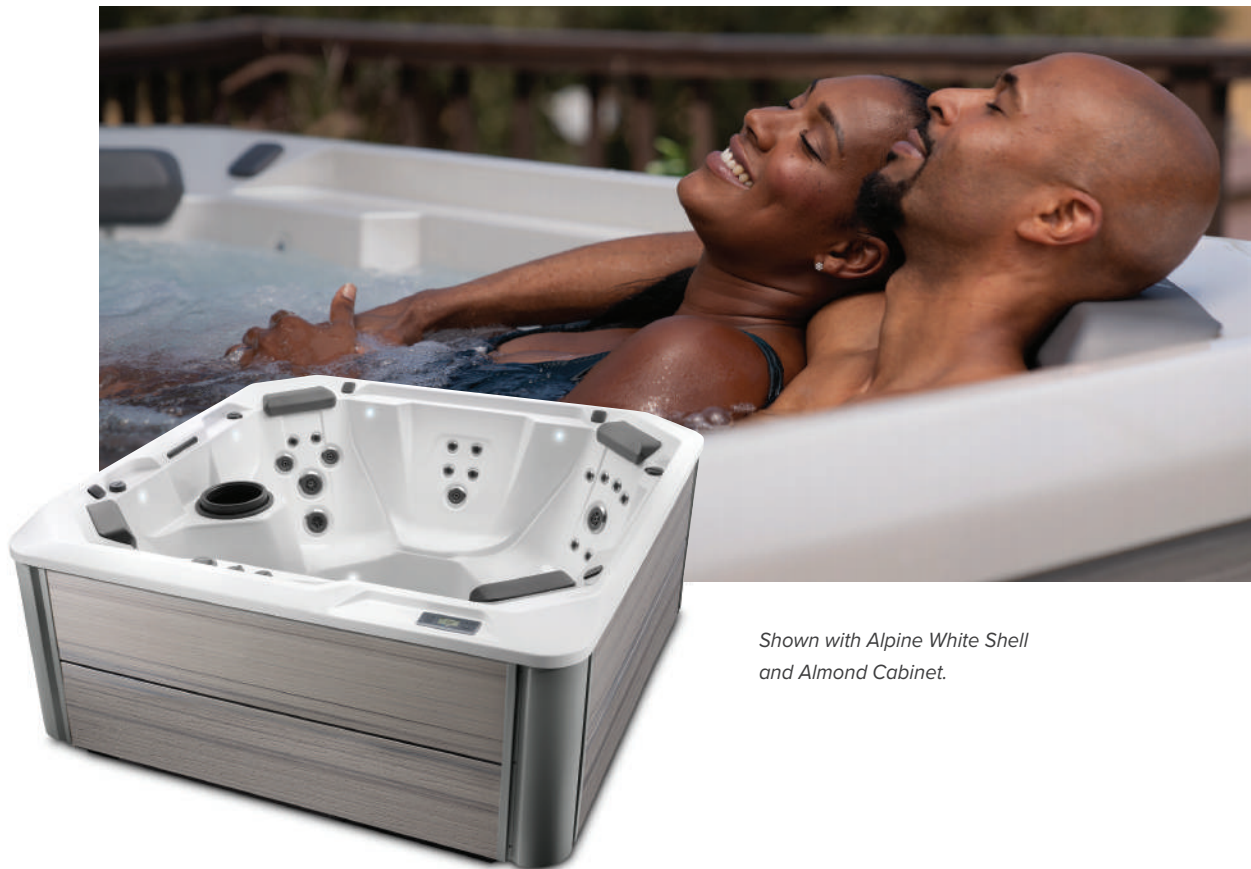
Shown with Alpine White Shell and Almond Cabinet.

People Seating Jets Voltage 7 Seats Open 40 Jets 230 V