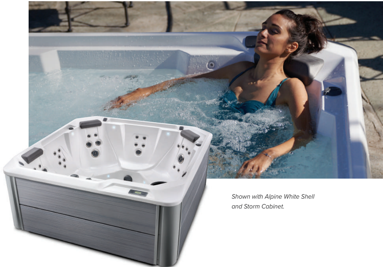
Shown with Alpine White Shell and Storm Cabinet.