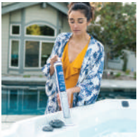
Frog® @ease® In-Line Cartridge Ready