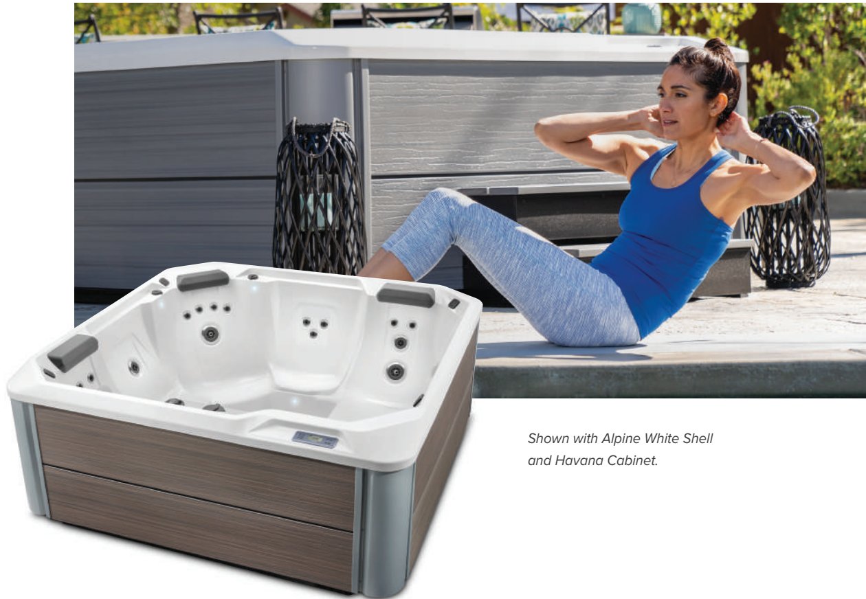
Shown with Alpine White Shell and Havana Cabinet.

People Seating Jets Voltage 5 Seats Lounge 24 Jets 115 V or 230 V